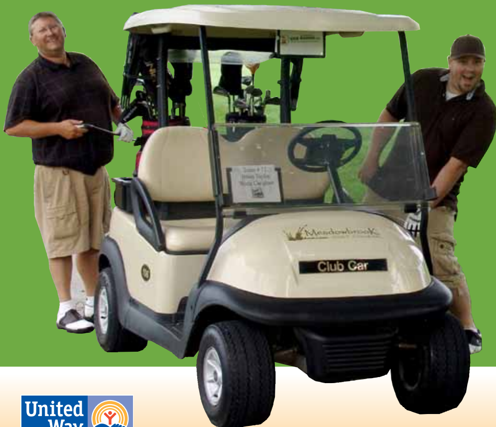
Top to Bottom- The winning first place team of WalMart enjoy a break at the 4th Annual Golf Classic