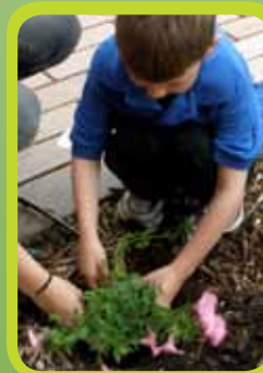
The Alternatives' Kid Connection program is teaching children to give back to the community. Kids adopted the downtown corner in front of the Paramount by planting and caring for flowers that beautified the downtown landmark.

Second Harvest Food Bank Produce Program ..... $40,000 Coordinated Approach Hunger ..... $25,000